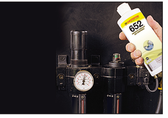
Chesterton 652 used to clean and protect the tools.